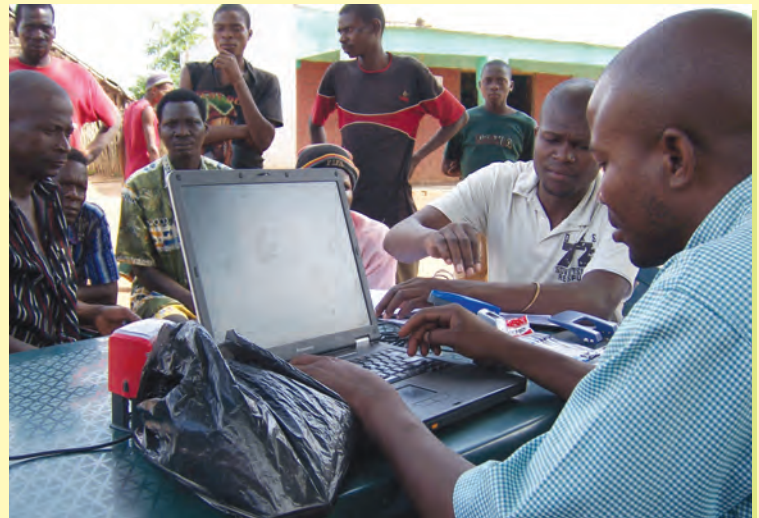
An Opportunity Mozambique loan officer uses Enterprise Open Sky technology to set up accounts for farmers and rural families residing in the bush.