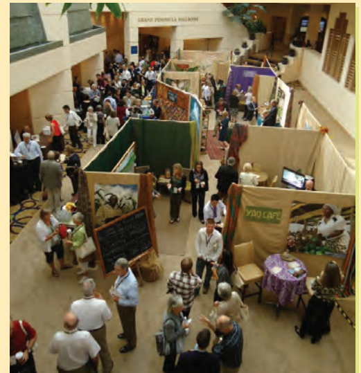
Interactive “Get Involved” exhibits at 2011 conference

Visit opportunity.org/conference to watch videos of key presenters.