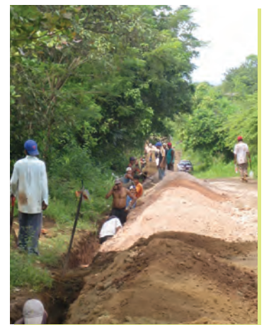
Community members dig the one-mile trench by hand in La Laguna, Nicaragua.