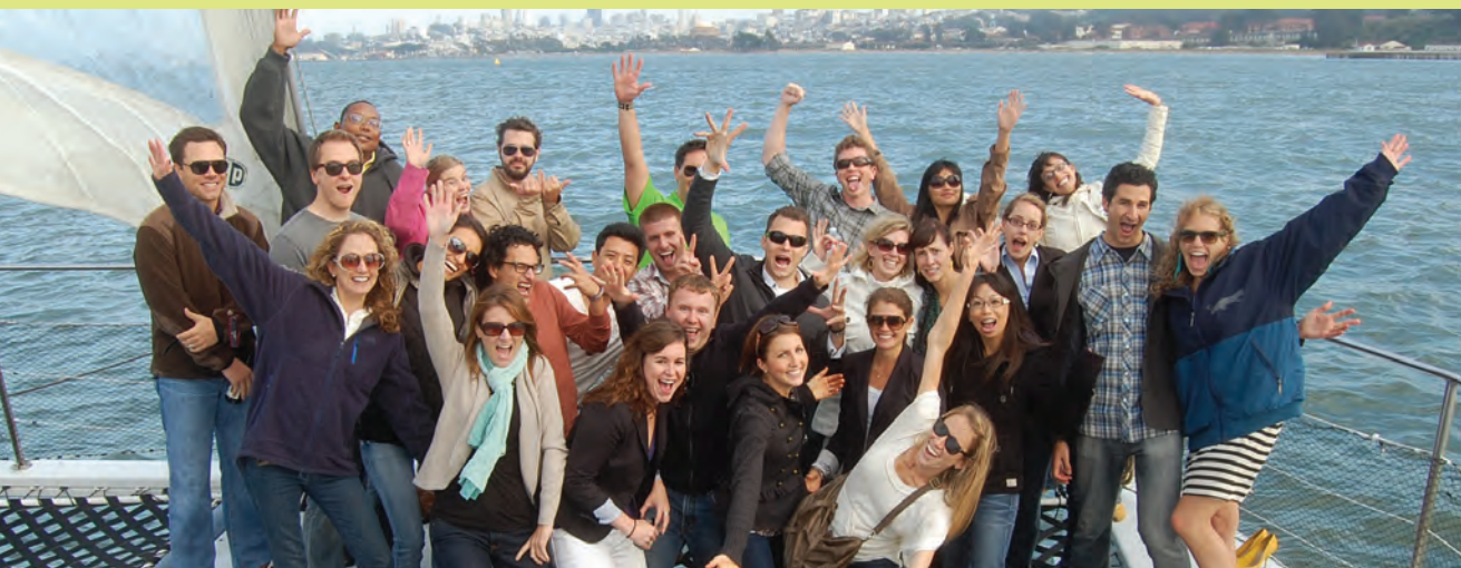
Young Ambassadors take a post-conference boat cruise in San Francisco Bay. Over 50 YAO members attended the conference.