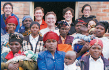
Trust Group meeting near Musanze, Rwanda

With a central location already open in Kigali, Rwanda's capital, UOMB will expand banking