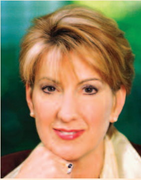
Carly Fiorina Former chairman and CEO of Hewlett-Packard (HP)