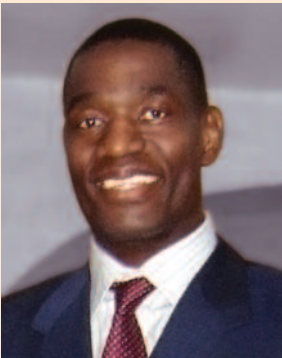
Dikembe Mutombo Houston Rockets center

In May 2007, Opportunity International welcomed two new all-stars to its Board of Advisors: Carly Fiorina, former chairman and CEO of Hewlett-Packard (HP), and Dikembe Mutombo, Houston Rockets center and president of a foundation in his own name that works to improve the health, education and quality of life for the people of the Democratic Republic of the Congo (DRC).